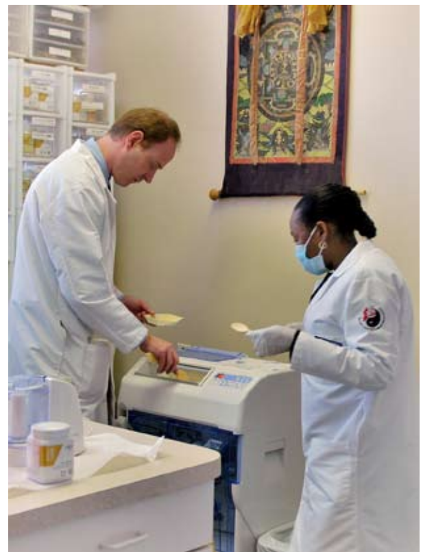
Students work in NYCTCM's state of the art herbal dispensary

Prerequisites: Herbal Formulas 1, 2 & 3, Syndrome Analysis