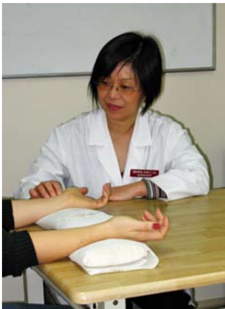
Pulse diagnosis at the NYCTCM clinic.

Prerequisites: Acupuncture Treatment Principles. Clinical Acupuncture Practice 1, 2, & 3 can be taken in any order.